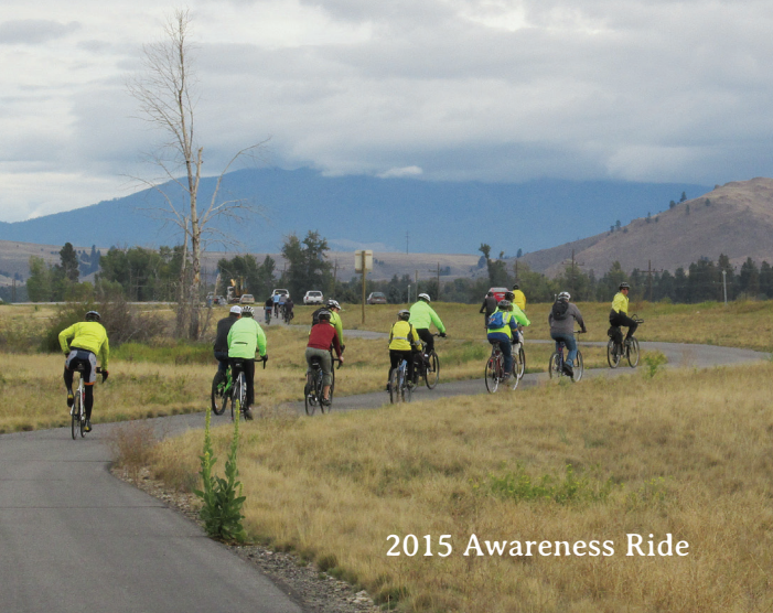
2015 Awareness Ride

We led the first Legislative Bike Ride with five legislators attending and helped organize an Awareness Ride in September with more than twenty riders, including five legislators.